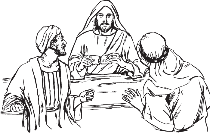
Te Naa nayadooawabe besasoo ka Te Pabe'e-witu ne tuukwe (Luke 24.30)

yosuhoose ka Jerusalem-witoosoo kokodyuhooka, okow yongonasoo. 33 Ka mu pepetugase no'yoona Te Pabe'e yadooawabe nanano o, ewa'yoo numu punno'o mu-kumisoo. 34 Umu ka mu waahoo mee netamma, “Soo Te Pabe'e togesapa tu ya'e-kwikoo namayodu, Simon Peter ka Te Pabe'e poonne.”