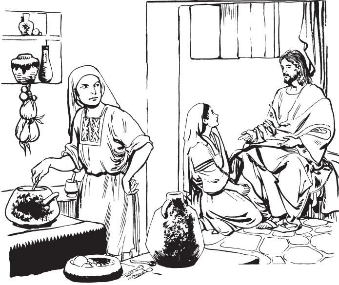
Soo te Pabe'e ka Mary Te Naa-witu tuukwe (Luke 10.39)

numme puu oo soomu'wa ka mu numu suda numme matugu. Ne matzino kaaheno ne mayugwe. O'no numme besa-kwitoo tsebooe petugakwu.”