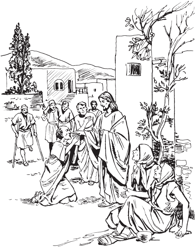
Soo gi tubootubuedu nana nasootuhi (Luke 19.42)

45-46 Soo Te Pabe'e yise ka hemma-ma tumudu-matoo meahoo. Soo Te Pabe'e ka mu numu oe'yoona hemma-ma tumudu tayapebu'ahoo oosoo ka mu manena gi toge'yookuna. Ka mu tayana soo Te Pabe'e mee mu netamma, "Soo Te Naa ka umu o'nosoo tu yadooawabe ekow po tugupu, 'Soo e nobe pukwi'yoona no'obatusoo numu nanesootuhikwu.' Mu ka e nobe-kwi'yoo gi besa manakwe ka mi'yoona nanatuduhana."