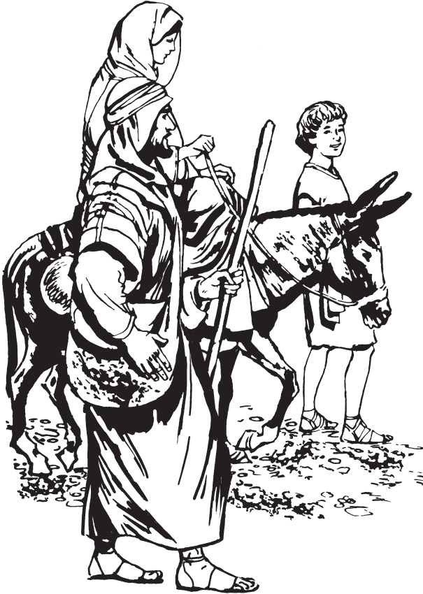
Sumu tomo'yina soo Te pabe'e tu naanapua'amu- no Jerusalem-witoo meayakwe (Luke 2.41)

besasoo mu tutubengayakwe. 47 “Esoo besa oo nakasopedakwadoona mu mesoo nanekwegeayakwe, tooe togesoo naatsepana,” mee mu nanesootuhibu numu oo soobedya. 48 “How manena soo Jesus mow mu numu tunedyooedu yadooe katu?” mee oo naanapua'amu sokwama. Soo oo pea yise meeo oo netamma, “Manatu tooe numme u too'e wate. U sakwa uga gi 'yoo suda ne matugupana.” 49 Soo Te Pabe'e oo nanekwegease meeo, “How yise manena mu e too'e wate? Mu mooasoo oo sopedakwatoon nu yaa E Naa-baa oo nakabetseana.” 50 Soo Te Pabe'e naanapua'amu oo unnena gi nakasopedakwatoon.