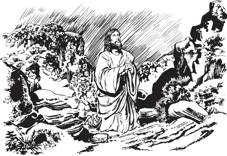
Soo te Pabe'e numu-wanatoo mease nanesootuni (Luke 4.2-3)

Tooa'ana. U sakwa ma-kooba'yoona nadawunihoo. 10 O'no soo Te Naa u magwetzoikwu oosoo ka meeoo nabotuguna,