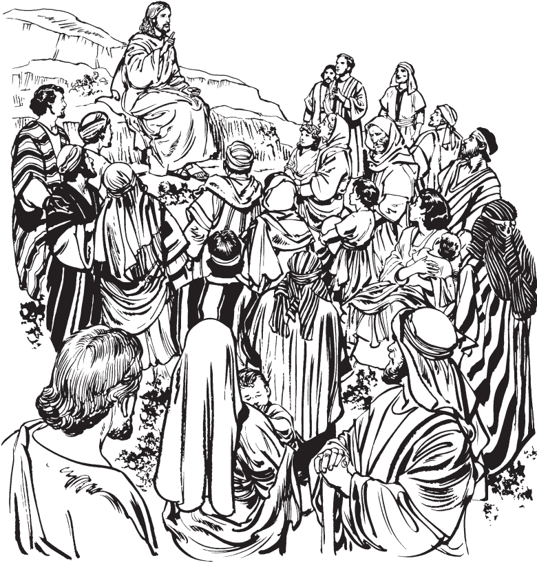
Po'wa-ma katuna mu numu tunedyooe (Matthew 5.5)

14 Tamme sakwa numu kootabuakudu-kwa'ne manepunne. Soo kootabuadu ka giba-ma'yoona puu kwinga'yoopana mesoo napoonne. 15 Soo tukootabuakunoo ka paa'a'yoona kwinga'a-kwitoo mesoo kootabuakute. Soo numu nobe-kwitu puu ka kootabuapunnena numu no'oko hemma mesoo poonne. Gi soo numu ka tukootabuakunoo-kooba hemma hane. 16 Yoonnekoo ewa'yoo numu ka besa manena, ka tukootabuakunoo-kwa'nesoo, o'no yise mu numu ka Te Naa netubetse'yikwu.