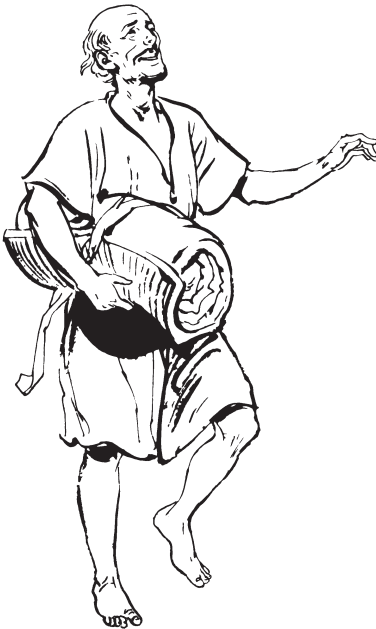
Soo gi yutsengadu wunuoose ka tu kapa nobe-kwitoo tzakwuga (Matthew 9:9)

14 Umu John pupua'amu-matu yise ka Te Pabe'e-baa petuse mee unakwe,