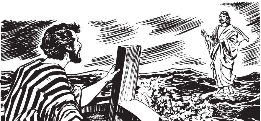
Soo Te Pabe'e ka sake-witoo baa-koobakwi kemmaki (Matthew 14.27)

27 Soo Te Pabe'e yise mee sookweta unne, “Gi suipana. Nu yow kemma.” 28 Soo Peter yise mee oo netamma, “U ka togesapa Ne Pabe'ena ka