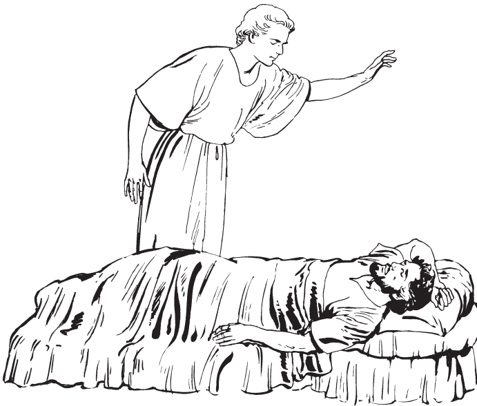
Soo toha kasa-ga'yoo ka Joseph-baa petu oo nose-kuwi (Matthew 1:20)

18-19 Ka Te Pabe'e yaa'a teepu-koobatoosoo nadooa'adoopu-witu nu mu tuukwekwu. Soo Mary ka Joseph koomadookwuse yise Te Naa Besa Pooha-toohakwi koheahoo. Pana soosoo Joseph gi oo nakasopedakwatoosoo ka Mary Te Naa Pooha-toohakwi oo kooheana gi oo nodukwadookwu mee soonamme. Soo Joseph besa sootumatuguna gi numu tuukwe'e ka Mary kohea-kwitu, gi oo soomanasookwikuna. 20 Oetu ewa soohanena, soosoo Joseph yise mee nose. Soo Te Naa tummatziwabe toha kasa-ga'yoo meeoo oo tuukwe, b gi hownne'yoo ka Mary nodukwadookwuse, oosoo ka Te Naa Besa Pooha-toohakwi kohe'a. 21 Ka Mary saa'a tooa-doose, u sakwa yise Jesus mee oo nea, Numu Magwetzoidu, mee na'unnedu. Oosoo Jesus pumme nanumu, pumme naka'oedyukudu magwetzoikwudu, ka suda mu tumatuguna mu nemawunikwudu."