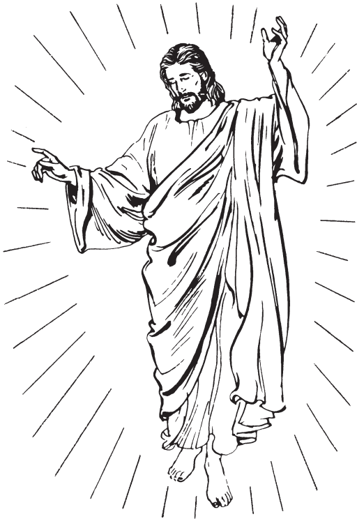
Ka te Pabe'e nanesootuha'e oo-kooba atasoo tabuaga'a (Matthew 17.2)

17 1 Naapahe tabe mease soo Te Pabe'e pihoo tu pupuamu oona kiba-matoo bika, mu oo pupua'amu mee nananeadu Peter-no, James, yise oo wannga'a John. 2 Togesoo ka Te Pabe'e nanesootuha'e oo koba atasoo tubuaga'a, yise pukwi oo namasooana tohawiyaneaga'a, yise patakwetseapunne. 3 Waha'yoo nanana Moses-no Elijah mee nananeadu yise oo-baa petuse oo-no yadoo'a. 4 Soo Peter yise meeo ka Te Pabe'e netamma, “Besa numme ka yaanona, ka oo u soomanakwe numme sakwa pahe tutukutsekoo tatza nobe mu matabuekwu umme Elijah yise Moses.”