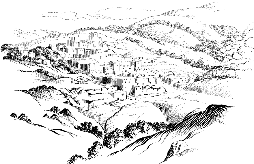
( Marcos 14.3 )

Hoka kirawaneha ohiro 6 xakore hoka Jesus nexa: — Xahalakihena exe ohiro! Xoanere hoka xexamaikohalonikihenene? Hiyaiya, waiyexe atyo tyoma nomani. 7 Hiyaiya, maoloxaharenai atyoite tyaota mene xikakoa hoka xoana xowaka xamani atyoite xakahinaetyahene xaokowihena hoka xakahinaetyahene. Hoka natyo atyoite maisa notyaota minita xikakoa. 8 Háomane heko atyo tyoma: hiyaiya, nokamani nahitita atyo tyoa airaxeharetya noháre, noxafityaki niyahare. 9 Aliterexe nomita xihiyeha: hakakoare waikohekoa atyoite, aliye xamani Iraeti Waiyexe kaxakaihakatyaka hoka kaxakaisakaite exe tyomehenere hoka kaxotyakehetaite exe ohiro — nexa Jesus ihiyeha.