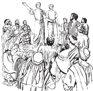
Hechos 1. 6-11c

8 As tul la ok u Tiixhla Espíritu tu vetaanxelale', as la ek'ul ve't etijle'm. As la epaxsa ve't u b'a'nla yole' svi' xo'l unq'a tename' tzitza' tu u