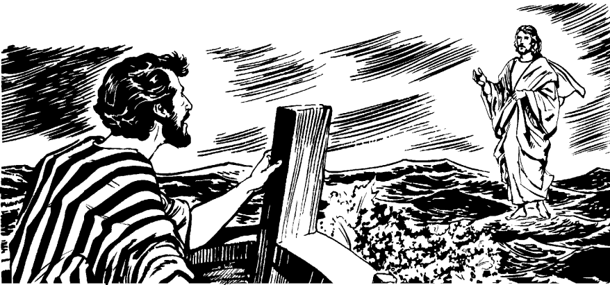
(St. Mark 6.49)

45 Ajitt'ëe gwagwahkhan Jesus, ditsyaa naji tr'ihchoo zhit inlii ts'a' giyehkii van nduhts'ajj Bethsaida kwaiik'it gwats'a' gahahjil goovıłtsajj. Adan zhat dhidii gwiizhit dinjii łeeljil naji nakhwazheh gwıts'ee khwajyaa goovahnyaa. 46 Ajitt'ëe dinjii naji datthak neenahal'yaa ahnyaa ts'a' goołeehoozhii ajitt'ëe taih kat gwats'a' haazhii, ideenjit khagideedi'. 47 Nijin zhat khaa nagwaanajj daj! tr'ihchoh tth'aii hee vant'an dhitin, gwiizhit Jesus tth'aii hee adan zhrıh nankat dhidii. 48 Ahtr'aii niint'aii haa goodahtr'aii geh'an, ditsyaa naji tr'ihchoh zhit gwint'aii taą'ajj haa chų kat geekwaa goovaąh'in. Zhyaa gootak tr'ihheehaa indhan. Vanh daj! hee 3 AM ts'a' 6 AM gwıdeetak gweedhaa gwiizhit Jesus vitsyaa naji chų kat goots'a' ahaa nigiyiil'in. 49 Gaa nijin chų kat ahaa nigiyiil'in daj!, ch'ankey'aa t'ii'in giindhan ts'a' khashraagiinrat. 50 Gaąnjat nagaanaii geh'an.