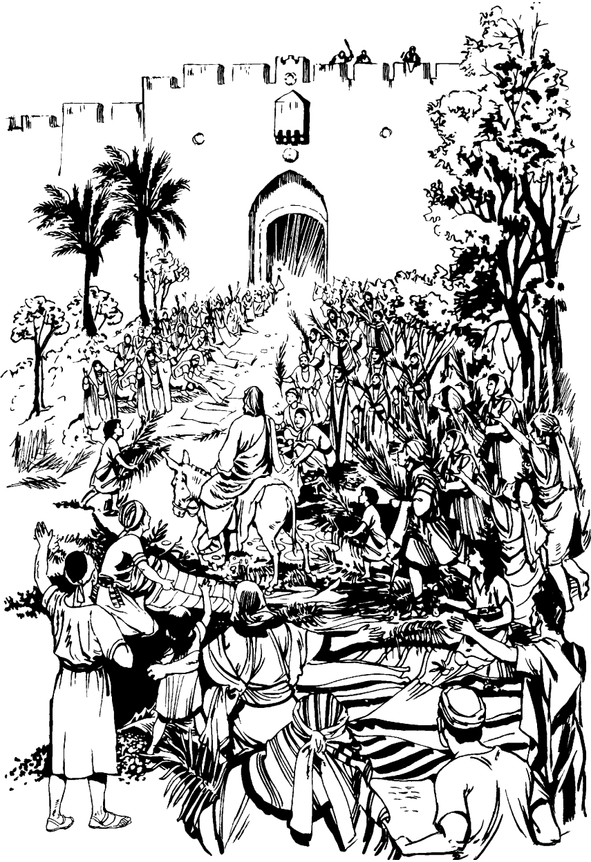
(St. Mark 11.7)