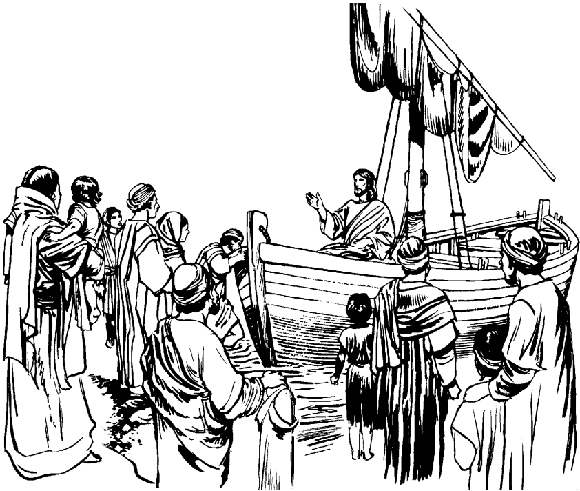
(St. Mark 4.1)

4 1 Galilee van vee gwa'an, chan hee Jesus geech'ooheechya', gaa tr'ihkhit veelin dinjii gwanlii ts'ajj tr'ihchoh zhinzhi ts'a' naadii. Van vee gwats'a' niight kwaa tr'ihchoh dhitin, gwiizhit dinjii najj teeghai nigeelzhii. 2 Gwinlejj goovaagwahandak geenjit gwandak ahtsii zhit geegoovahtan ts'a' jyaa nyaq, 3 “Ch'oodqhk'ijj! Ch'ihlan dajj dinjii ch'ihlak gwanzhij dehk'it gwa'an gwats'a' haazhii, ts'a' gweheeshii. 4 Ajits'a' gwanzhij