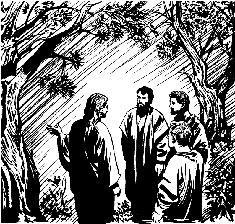
Jesus ts'ꝯ' Peter, James, John haa (St. Mark 14.33)

32 Gethsemane geek'iidal, ts'ꝯ' Jesus ditsyaa najij t'ahnyaꝯ, “Dzaa dook'ij khadigihihijyaa gwiizhit,” nyaꝯ. 33 Ts'ꝯ' Peter, James, ts'ꝯ' John haa dahaa haadlii, gwint'oo tr'igwidii gwizhit khaiinjich'iighit. 34 Aijits'ꝯ' t'agavahnyaꝯ, “Shidrii zhit tr'igwidii