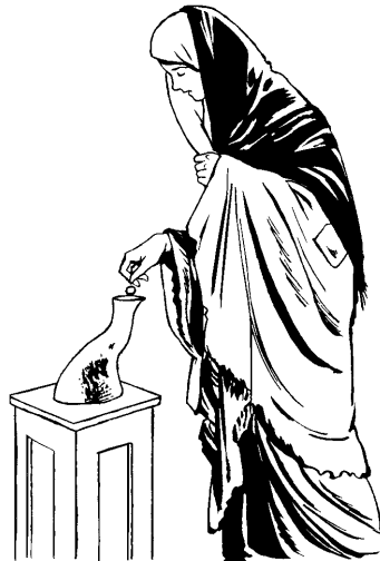
(St. Mark 12.42)

41 Jesus nijin Kharigidiinjii Zheh gwizhit dinjii naji laraa gwizhit gilee gwideek'it geeghaii naadii, ts'a' dinjii naji laraa gwizhit gilee gwah'in, dinjii valaraa gwanlii naji, laraa leji gwizhit gilee goovah'in. 42 Tr'injaa neeshraahchy'aa vakai' niindhat gwiizhit zhat niizhii ts'a' laraa ghoo tsal neekwaii $.01 aanchy'aa gwizhinlii. 43 Ajits'a' ditsyaa naji