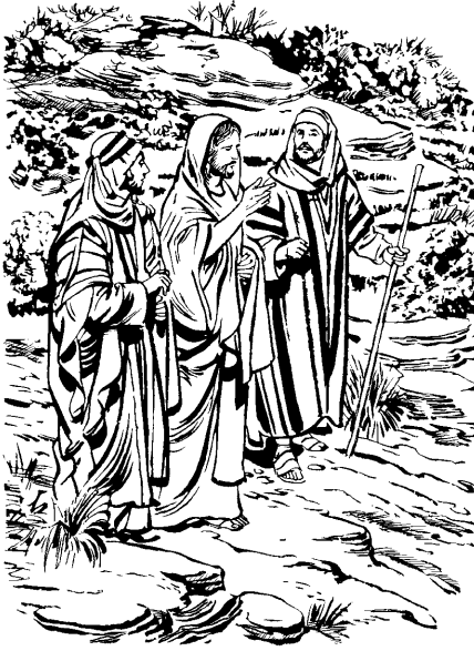
(St. Mark 16.12)

gwik'injiighit ts'a' chüü vats'an tr'itsajj t'ee neehezhi, gaa juu gwik'injiighit kwaa t'ee vatr'agwaanduu datthak vaa t'ihpeechy'aa ts'a' Vit'eegwijyahchy'aa an yahahtsyaa t'oonchy'aa. 17 Juu gwik'injiighit najj t'aih goovant'eeracheelyaa ts'a' gwinlejji gwide' t'igihee'yaa t'oonchy'aa. Shoozhri' zhit ch'anky'aa iizüü lejji dinjii najj ts'an tr'igiheelyaa. Ch'anky'aa Shroodiinyaä zhit ch'izhii ginjik ky'aa gigiheehkhyaa. 18 Ajjits'a' gyüü choh neegahahchik akwat ch'oondaih iizüü (poison) geenj' ji' gaa nihk'it duuyeh k'eegwiichy'aa t'iginjii t'oonchy'aa. Juu ilts'ik najj gaa kat nagahaandal ts'a' gaveenjik gwinzii neegweheelyaa.”