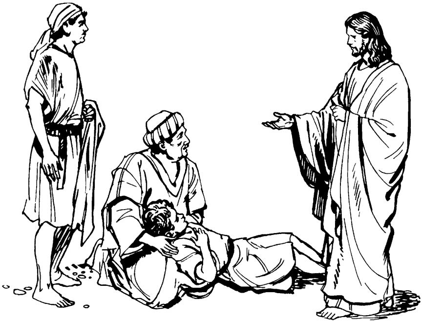
Jesus, tsyaa tsal eenjit gwinzii neegwiłtsaii (St. Mark 9.20)

19 Jesus ditsyaa najì jyaa dahnyaa, “Łyaa nakhwagwik'injigwiighit kwaa łee shakhwandaii nahoihnyaa! Deegwaghkhyuk zhyaa nakhwaa t'ihihchy'aa shoohnya? Ájì chyaatsal dzaa shats'á' hohchijì!” 20 Jesus ts'á' nigiiyaahchijì, ch'an'ky'aa iizüü Jesus niil'in gwagwahkhan tsyaa tsal gwint'aii daatrat iltsajì ts'á' nankat nat'aanajì ts'á' neekhiital gwiizhit goghoh viyik gwats'an tr'aatuu. 21 “Deegwaghkhyuk jyaa dinchy'aa?” Jesus yiti' oahkat. “Tr'iinin tsal, nilii dajì' gwats'an jyaa dinchy'aa t'inchy'aa. 22 Yehdaa tr'igwihee'aa