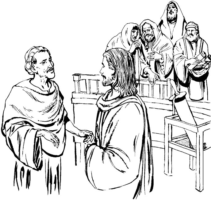
(St. Mark 3.1)

dhidlit t'ahnyaa “Aanaai dzaa dinjii naïï andah shats'a' hinkhaii.” 4 Aïït'l'eë Jesus dinjii naïï oahkat, “Dii-law Neegwaazhii Drin zhit deegwehee'yaa goo'aii gwinyaa? Dinjii ts'igweheenjyaa akwat dinjii ts'arahahthaa, dinjii viheekwaa gwits'i' vits'igweheenjyaa akwat dinjii ehdaa tr'igwirehee'aa?”