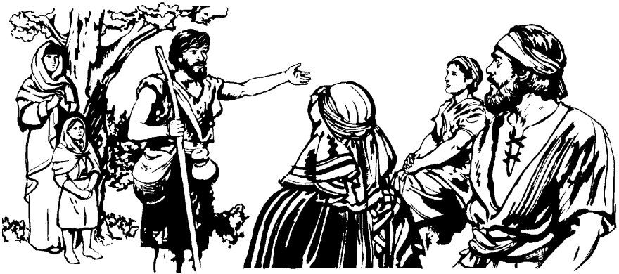
John chųų gwats'an ahtsii geegch'ąąqhtan (St. Mark 1.13)

12 Gwagwahkhan ľąą nangwinjir gwa'an gwats'ą' Ch'an'ky'aa Shroodiinyaą haazhii yiłtsąjį. 13 Ts'ą' drin 40 gwhiteegogwaąnchy'aa datthak zhat nangwinjir t'inchy'aa. Izhit zhat dąjį Satan yik'eegwandaii tr'agwaanduu t'ih'e'yaa ji' geenjit. Izhit gwa'an nin iizųų gwanlii tee gwa'an t'inchy'aa gaa zheekat gwich'in nąjį giits'ą' haajil ts'ą' giits'iinya'.