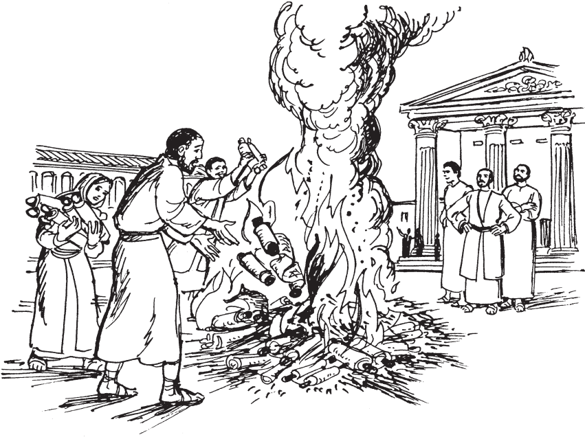
Washunand ichinguru wishun wirkar zapan xanateersin, mbutarangana. (19.19)

wishunumuntana atusin, wishun wirkareetssin yushindarangana. Washunand ichinguru wishun wirkar zapan xanateersin, mbutarangana. Tputssha ichingurusin wach parangana. An kirak washunand kurikimand zapani 50 milo waritarangiya. 20 Ashirucha, ashirangsin, Isusoo kuk wanasir izapaneerangu, Isusootsimarisha kuk chinarangana.