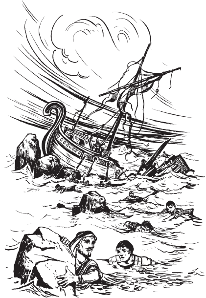
Was chatship tpoó tpoó ashimbapu, botee pátangarangiya. (27.41)