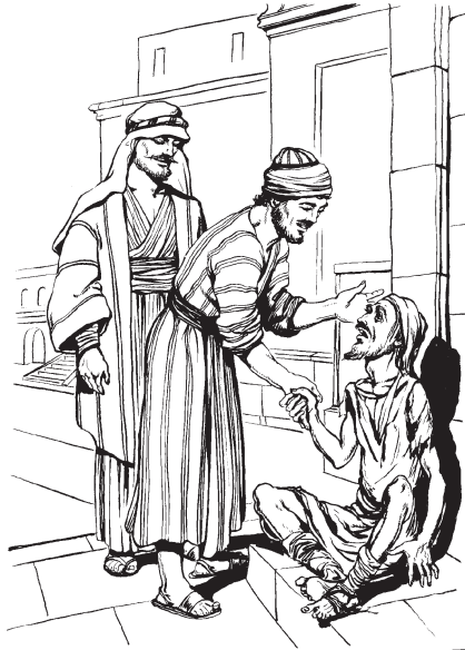
Wang, Pitorpa naantaatssin, churambee chamayanganganaya. (3.1-10)

3 1 Minush zar Wangpa, Pitor: Apanllip pang' naamani; Apanllpa tsiya-tamani, tárangusin zar pukamchu naataranganaya. a 2 Tputsee chamayanganganaya. An tputs wats uru churambimuna. Kanxumandari tatsipum uru wats kachumb kinarangiya. Apanllip panguchurambeetsi chipayarusin, putam zari wayata, putam zari wayata ashiranganaya. Pshtushinung Wanasirimshee tsurtaranga annung wayaranga. Tputs Apanllish pang' pshtukamchu anoo: Istanda; nuwaam kurikirish pananda; ántar ashtariya. 3 Ashiri Wang, Pitorpa naantaatssin, churambee chamayangayarusin, churambsha: Kurikirish pananda atina; tárangiya. 4-5 Pitorsha wchush napeeru, churambeetssha: Napanganlla, tárangu, uwsha churambsha mangshuritana panachazindanuwa átu napa ashirangiya. 6 Itaru, Pitorsha: Nuw kurikiri nduncha; tárangiya. Itaru, istachinllpa wanasiri. Isusumun shiyaa táchinllpa; Chiyzangi; naangi átana; Pitor, táranguiya. 7 Uwimunsha mbutsinungich putayaru, itsirta ichiyzata ashirangiya. Watssha wanasireeta ashirangiya; waxir-chee yarat ashirangtamta. 8 Churambsha tsingah xiytah ashirangiya. Naanata Apanllush pang' pshturangiya. Wangpa, Pitorpa, churambpa pshturangana. Mang' kis michitku, iriptara, piyamsha iriptara ashishtar ashirangiya. Apa-