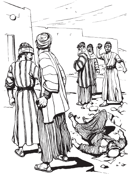
Paporoo putayarusin, patumbichpat tpuw tpuw tpuw ashishtarusin, tsiarpaz ashiru kasarangana. (14.19)

19 Utaáshuchsha tputs Pisídiyash tsap taarangana an ashpatam Ántiyukash yakat káyarusin, ashpatam Ikóniyash yakat káyarusin, Listarap kusarangana. Listarashchipa tputs tsiyateersin; Papor pachayani, tárangana. Tputssha ayu táyarusin, Paporoo putayarusin, patumbichpat tpuw tpuw tpuw ashishtarusin, Papor tsipayanlltanda, tárangana. Yaktash pachayarandsin, pshiyrtayarusin, kapeetarashinanaya. Tsiarpaz ashiru kasarangana. 20 Isuschichsha tputs Paporosh kusateersin, Paporoo