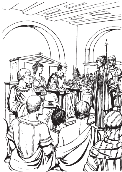
Paporsha tsiyatpi átu, uw paxayarangu, tsiyatarangiya. (25.23-27)

24 Písotsha tsiyatarangiya; Ich Agrípa, mazinangcha. Siy ichingurus nish