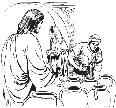
Isussha muchchuree: Kung tipayarus, muritsush tatsiteerus ksangints; tárangiya. (2.6-8)

yambirangiya; iyaatstam, Isusootsini wipunasheetsini yambirangitamta. Tputsee zapan yambirangu, 3 vinoo kawatsirangiya. Kawatskachu, Isussha wanir wipaa kaman-ku, Isusoo, vin kawatseenllpa; tárangiya. 4 Isussha: Ataa, ¿mayaamsha nuwaa átsha? Wand pishtakiya nuwaanaatsi yámamanda-maama. Nuw zari nda tatsamooriya, tárangiya. 5 Itaru, wanirsha kizaptatin tsiyat-kusin, Ipari siyaa kamachtakchu, waa kuk payungtsa; ngatintspa; táyaru kasarangiya. 6-7 Anush murits minam matayaru taara-angiya. Anoo uru iy Utaáshuchini kungupat maacheetsi yaramaam payutarini. Patumb-chee kachuteeruni, muritsaam kapungu tintarini; zameetpaparee arat, tatsitamaam waritarangiya minamtashu. Ashiri Isussha muchchuree: Kung tipayarus, muritsush minam matayaru tatsiteerus ksangints; tárangiya. Ayu táyarusin, tatsitarangana-ya. 8 Ashirucha, tputs kungoo ashpiri tatsiteersin, Isussha: Na, tipayarus, ksutamapaneem yásingints; tárangiya. Ayu táyarusin, tipayarusin, ksutamapaneem yásirangana-ya. 9 Ksutamapansha nda kungoo kácharangiya. Itaru, vinoo kácharangiya. Nda kungoo yasarangu, mapiyirangiya. Itaru, m'chachushtisin yasarangana. Uwsha ksutamapansha vinoo kis wayaru, kizpur