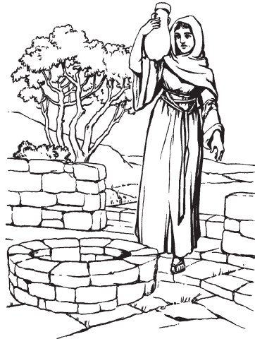
Samariyshuch kiz kung tipakatu k'tsimush kusarangiya. (4.7-10)

7-8 Katungsheemani paxanxattuni, kushimunini Samariyshuch kiz kung