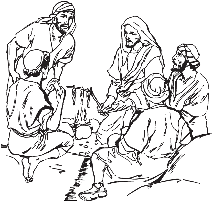
Isus támeeru, iyash yakarangu, iysha kchiptini washunandari zapanni parangtanicha. (21.14)

roo, kayupich yashini, táyaru, 11 Pitorsha botip iyaptatam zaruyaruni, areetaa putayaruni, mazachimun pshiyarangani. Kayupchee wazapan kawaranginiya. Washunand 153 putaranginiya watari-nandarita. Kapungtaa tatsiteeru, ashiritaa areet nda izichirangiya. 12-13 Iwapyaruni, Isussha: Neewa ktungangints; tárangu, katungtsee mbaseeru, iyaam panarangiya. Iysha anoo katungarangi-niya. Antaati iy: ¿Chakshasha shiya? tárangeezini, nda. Watam ichinguruni natstaranginiwa Isusootsi. 14 Ashirucha, washunand shaniyaranguni, nipta iyash tuchip zar yakarangiya. Isus tsiparangiata, támarangiya. Támeeru, iyash