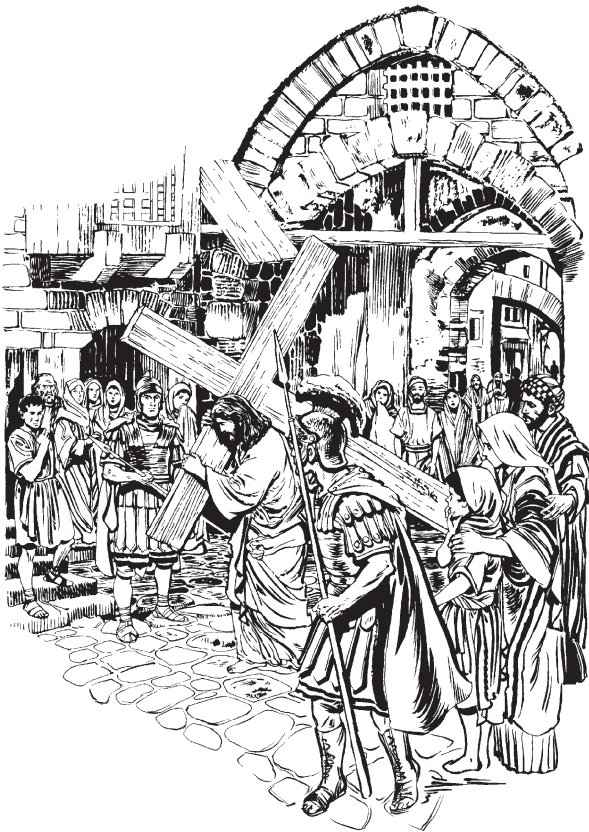
Isus waamat tstsamaam yasinaa kúrangiya. (19.17)

Ashirucha, sundarsha Isusoo machtarangana. 17 Isus waamat tstsamaam yasinaa kúrangiya. Irusarinush shitunga-