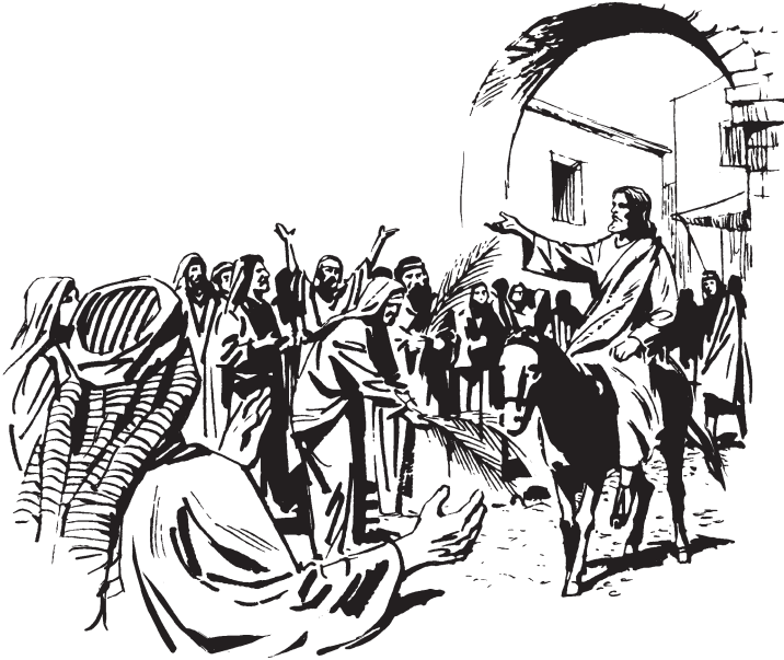
Yarinll tamapari ashiru pakich katupeersin, Isusoo chamayangani atusin iripurangana; zamangarangana. (12.12-16)

12 Putamsha tputs zapan shambatshisheem yuwaa Ijipoo tsap shitungarangana anoo itupshingamaam Irusarinash