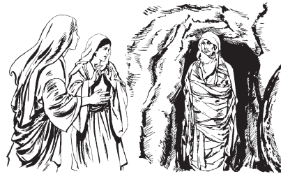
Shitungeeru, wandari wanuts ichinguru kuripamaw, ashiru shitungarangiya. (11.44)

38 Itaru, Isussha wandari mang' mantsaru, mapshiship naatarangiya. Anush kuseeru, patumbichpat wachoo kámanaru parangiya Isusu. 39 Isussha: Patumbich tawatangints, táyaru, Máratsha: Watsta. Tsipar kpuneechparee. Watsitparee, watam na ipunpunar zar maayanlluwa; tárangiya. 40 Isussha: Watsta tárinllpa. Nuwamun mangish tatungcha. Ashkinaareesha, Apanllee wizpuririni pangachsha, watam tárana-wa, tárangiya. 41 Ashirucha, tputssha patumbchee tawataranganana. Isussha kanindapsha napeeru, Apanllpat tsiyatarangiya. Apaa, watam shiy nuwaa uru mazinakshawa mashki anoosti, tárangu. 42 Ashiriya, shiy istangandama tina. Nuw shiyaa izuuru yasaktana. Ashirucha, in tputs nuwaa mangoonpana aturi, na shiyaa mashkina. Shiyaa kizpurirish pakchusin, nuwaa; Zuraktishcha: Isus watacha Apanll kamachtarangu anu, táchinllinaya aturi atina, tárangiya. 43 Tárangu, k'kuz zunganeerangiya. Zuwaa Lásaroo, naani; shtungangi; tárangu, 44 Lásarsha shitungta ashirangiya. Shitungeeru, wandari wats kuripamaw, uw kuripamaw, wanuts ichinguru kuripamaw, muchsha kuripamawtam ashiru shitungarangiya. Shitungaramchu, Isussha: Tapureerus ksangints; táyaru, tputssha tapurirangiya.