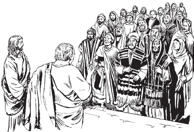
Pilaturin Utaáshuchpat kurakarín Isusoo tsiyatpi átu wishchip shitungarangiya. (19.1-6)

4 Pilaturin Utaáshuchpat kurakarín yusur tsiyatpi átu wishchip shitungarangiya. Kurakaatssha: Mazinangints; Isus yutaritaja tputsi. ¿Tamaree wanasirimshee pchangints nuw táchee? Ashiri na kizpur waneerangtana; waparitcha. Na pangatssa Isusootsi, tárangiya. 5 Táyarú, sundarsha Isusoo machirangana. Isus watunir ktsachimash k'tuntaru, misha kap tutayaru, kuras xatach ashirangiya. b Pilaturinsha: Napangcha; Watacha tputsi, tárangiya. 6 Kuraksha kizpur tsiyantayarusin, Yasinamun tstsambeerush ksangi; tárangiya Pilaturineetsini. Pilaturinsha: ¿Tamaree wanasirimshee tputs pachachich? Saana