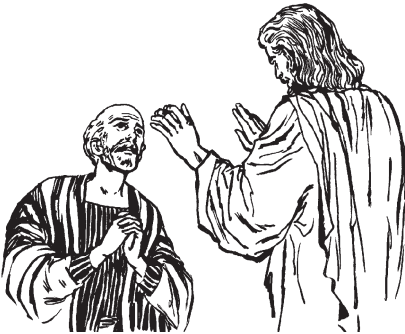
Tomásaa tsaseeru, Tomásaa zuwaa, nuwaa kuweetsi ptatanganda, tárangiya. (20.27-29)

26 Itaru, tsimbun maats matayaru maayaruni, minush domingo, anshutam yusur shaniyaranganiya Tomáspshta. Shtandashee yusur mbamaritam shtandaranginiya. Ashiritaa, Isus yusur iyash yakarangiya. Mangis mapiyngtsa; nuw watatana, tárangiya. Táyaru, 27 Tomásaa tsaseeru, Tomásaa zuwaa, nuwaa kuweetsi ptatanganda. Mishat, tandarameetsi kuwiptish ptatanganda. ¿Tamasha nda mangoonaksha? Támeena. Anoo mangoonangcha, tárangu, 28 Tomássha: Nuw shiyaa kurakartana; Apanlltishcha shiya, tárangiya. 29 Isussha: Shiy kachish parangish anumun mangoonarangsha. Itaru,