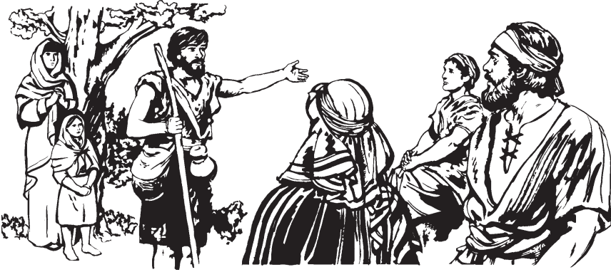
Wangarini ichumampanirini ipusap kusarangu, amb tpu- tsee chamayangayaru, tayaspatarangiya. (1.4-5)

5 Utaáshuchinand yakat kus kus ashirangana. Irusarinshuch tputs kusarangtamsin, ichingurusin yutaritshishirineetsi kamani-rangtamsin, Wangarinsha ichumarangiya Ortagush kungu.