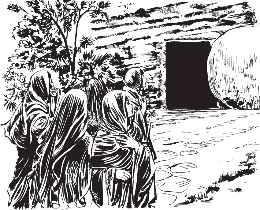
Nap ashkusin, mapshish wach' kawaru parangana. (16.3-6)

Pilaturinsha Usee: Ayu, Isusurini yángsi; táyaru, 46 Ussha kamisaa mburshimashi wanasiri paxanxeeru, Isusoo naruwayaruru, kamispat kuripirangiya. Yáyananllu, mapshisheem patumbchee kachutarangana anush Isusoo wayarangiya. Wachoo patumbichpatatam mbam shtandarangiya. 47 Mariy Matárinshuch, misha Mariy, Us waniri parangana Isusurineetsi wayarangana anootsi.