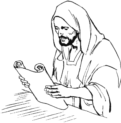
Kareta amon a'koka iya. (5:5)

6 Miri a'tai, karimeru mure ene'pɔ uya. Iye'mɔ'sa'kasa' esi'pɔ apono' aporo' po, asakiri'nan kon ene amɔ' miri awonsi'ki itepuru ton esi'pɔ iwoi. Karimeru mure usene'pɔ iwisa' rɔ'pɔ pe, 7 kaisa ri iretu miri awonsi'ki 7 kaisa ri itenu ton esi'pɔ. Miri ton esi'pɔ 7 kaisaron kon Papa A'kwarɔ amɔ' m seri non emɔ' kaisa ri enno'sa' kon. 7 Iti'pɔ kareta amon mo'kai', apono' po iyereutasa' na'ne' emiya enwo'netɔ apai. 8 Miri kareta amon mo'ka iya a'tai, asakiri'nan kon ene amɔ' miri awonsi'ki 24 kaisaron kon itepuru ton e'sekunka'pɔ irakɔi'. Tanporo wai, a'pu tato' esa' pe to' esi'pɔ miri awonsi'ki to' pɔsawɔ ton korɔ pun konekasa' yau a'po'na' nan esi'pɔ. Miri esi Papa munki amɔ' ipɔremasa'