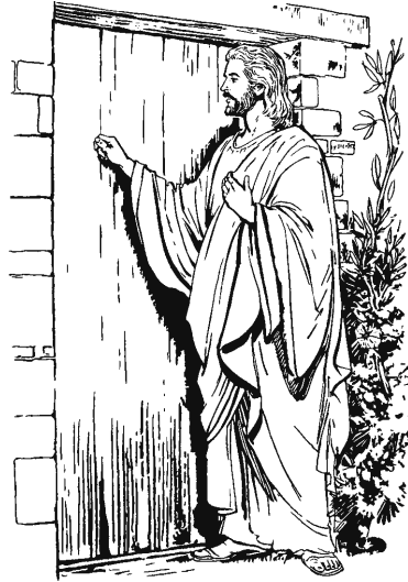
E'mu'sa'kasa' mura'ta nau iwipitu pi'. (3:20)

4 1Miri tupo, uyenu taru'pu uya, mura'ta uta'kokasa' Epun po ene'pu uya urau. Miri a'tai, wapiya uneta'pu wai, taronpi' warai maimu uya uyauro'ka'pu, “Enu'ki seri ya', miri awonsi'ki ipi' enpoikato' pe uya te'ku'sen ton seri tupo,” tukai'. 2Inke para ri Ita'kwaru ya' ena'pu, miri yau apono' esi'pu Epun po, miripan po ka'pon ereutasa' esi'pu. 3Iyereutasa'