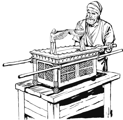
korɔ ke ipi'pi'tisa' ekonekan nisa' en (9:4)

6Seri kasa si ikonekasa' ya', use'man nito' tɔrawasomanin nan ewomɔ isi'pakiri ri kipo'pon iwa iwa'kɔ'sa' ta' tɔtɔrawasooi kon ku'se'na. 7E'tane use'man nito' tɔrawasomanin nan epuru riken ewomɔ i'nawon iwa'kɔ'sa' ta' tikin ite'kwa riken wɔipiya yau, mɔn esa' pe kuru itito' pe iyesi tɔntɔton pe tɔmakooi epe'pɔ pe miri awonsi'ki ka'pon amɔ' makooi epe'pɔ pe to' nɔkupɔ'pɔ i'tui'ma pɔra ri. 8Wakɔ A'kwarɔ uya enpoika'pɔ seri wini Ipan Wakɔ Kuru Pata e'ma uta'kokasa' pɔra iyesi moro ri mari wapiyaro' tɔponaron iponaro' ta'porin esi pi'. 9Seri seri, seri a'taino ekamanin, tɔtɔsen, use'man nito' ike itusa' rɔ'pɔ uya apuripi'nin nan ewan