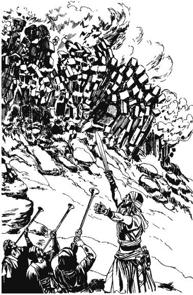
Iseri'ko wekupiri uta'mo'ka'pu, 7 kaisa ri wui iwoi Esuweru amu' utipitu'pu e'soru'mai'ma tupo. (11:30)

kon i'se p̄ra to' esi pi', waku te'm̄sa'kato' kon epoto' pe t̄uya'nokon te'san teriku kon t̄upo. 36 T̄aron kon uya t̄apatakapītu kon moronka'p̄u tari'po'pitu kon, t̄aron kon auronpītu'p̄u pariki'si ta' to' t̄apitu'p̄u to' uya. 37 To' wini'p̄u ti' ke; to' sara'mo'p̄u saka ke a'sa'm̄yai; supara ke to' wini'p̄u. To' upinim̄'p̄u karimeru miri awonsi'ki kapirita pi'pi ipon pe, entu'ma', ikota'masa' pe e'ne' pe miri awonsi'ki iri pe ri iku'sa' pe— 38 non esi'p̄u waku pe p̄ra ri