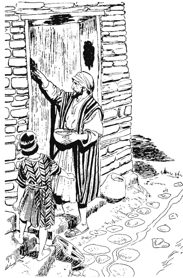
Mun pai'pai'mato' pe mu'ra'ta wakapuri pona to' uya ikuu'pu iya. (11:28)

esi epe'kena' pe Isi' pon mamin entai tukai' i'tu t'uya ke, ap'ne pu'ra tepe'pu inepopai tesi pi'. 27 Apurito' wini Isi' nimi'pu iya, kin sakoroo' pi' te'namai' pu'ra; sa'man annau ri ap'ne pu'ra t'ausensen pen ensa' t'uya pi'. 28 Apurito' wini To' Epo' Itito' pi' enta'nan nito' tipiyaruka'pu iya. Miri a'tai, mun pai'pai'mato' pe mu'ra'ta wakapuri pona to' uya ikuu'pu iya, wapiya iyentusa' ma'tanu'nin uya wapiya iyentusa' Esuweru amu' mu're ma'tanuku namai'.