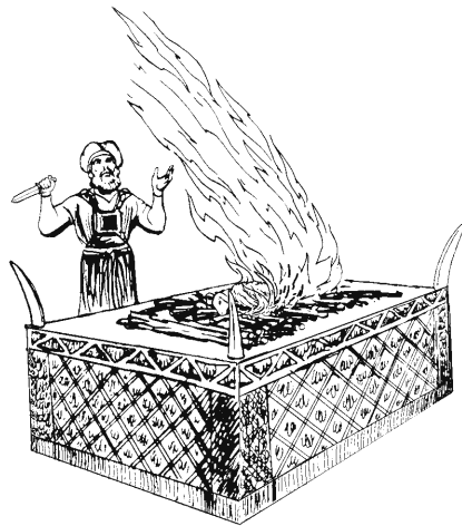
Iyepori'ma p̄ra iyese'pu ipo'ti pe tut̄usen pi'. (10:6)

“Use'man nito' ike miri awonsi'ki tut̄usen i'se p̄ra iwesi'pu, e'tane upun inkoneka'pu; 6 iyepori'ma p̄ra iyese'pu ipo'ti pe tut̄usen pi' miri awonsi'ki makoi ku'sa' epe'pu pe tut̄usen pi'.