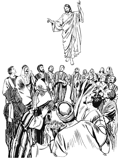
To' purrema pi' iyese koro'tau, itanamu'pu Epu pona. (24:51)

50 Miri a'tai, Sises uya to' ari'pu Surusiran poi a'ko pe ri pata Pe'tani piya'. To' uya eposa' a'tai, temiyatu tanunse to' purrema'pu iya. 51 To' purrema pi' iyese koro'tau, to' nimi'pu iya, itanamu'pu Epu