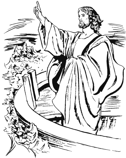
A'setun miri awonsi'ki tuna esereme'nin (8:25)

26 Miripan kon si uti'pɔ Kerasa' nono pona seri si parau ku'pɔri