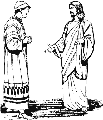
Imaminke' Moineri'pi (18:18)

turu pa entu'manin nan ena', miripan epe'pu pe waku eporo pa Epan po. Miri ku'sa' auya tupo, upikiri si isi'ki," ta'pu iya. 23 Seri etasa' iya a'tai, ipan pe ika'ni' pura iyena'pu, arune pura imaminke' pe kuru iyesi'pu.