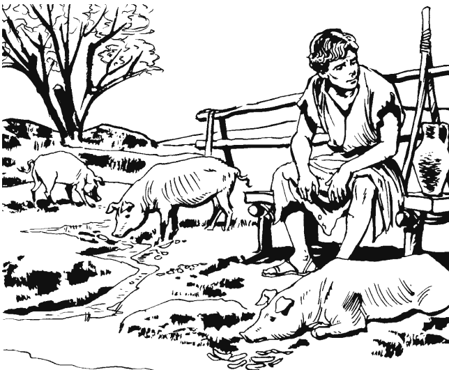
Miripan uya tikun non peiruku amu' ewe'se'na ennoko'pu. (15:15)

"Inni ri mari iye'tane, ikupunu uya ensa' esi'pu. Miripan tense isentu'ma'pu, miripan eka'tumu'pu a'sise'na. Miri tupo, ereutanuku'pu iya, a'su'kapitu'pu iya etupa pe. 21 Imu uya ta'pu ipi', 'Papai, e'makoimasa' man Papa winikui'