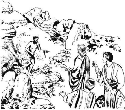
Sises ensa' tũyua a'tai, iyeka'tumũ'pũ ipiya'. (5:6)

pe ri Sises pawana'ti pi' iyesi'pũ miri pata yapai iri a'kwarũ ton ennoko iya namai'.