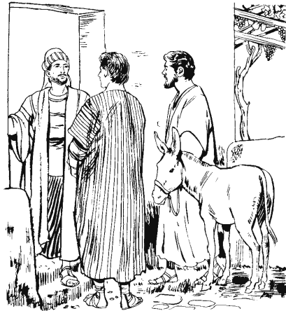
To' uya isa'ka'si miri awonsi'ki imɔre ne'kaa'pɔ. (21:7)

"Usana! b Kin Tepi' pa ru'pɔ apuripitu seri!" "Pori' pe kuri esi miri Itepuru ese' yau nɔye'ai'ne!" "Usana ka' entawon yau!"