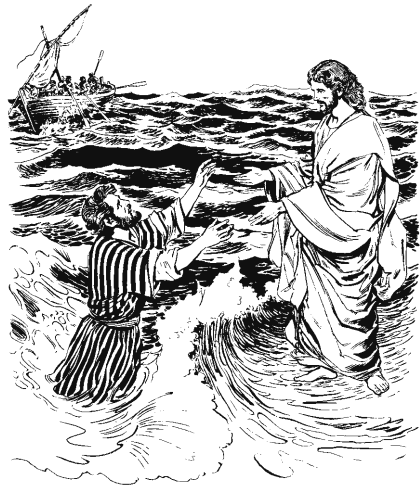
"Uyepuru, upika'ti'!" (14:30)

32 Kanau ya' to' ekanwa'tisa' a'tai ri, a'setun ereuta'pũ. 33 Kamoro nin si kanau yawon kon uya apuri-pitũ'pũ miri, "I'napairi ri Papa Mumu pe iwesi," ta'pũ to' uya.